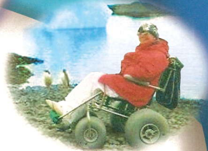
Landeez owner in Antarctica!